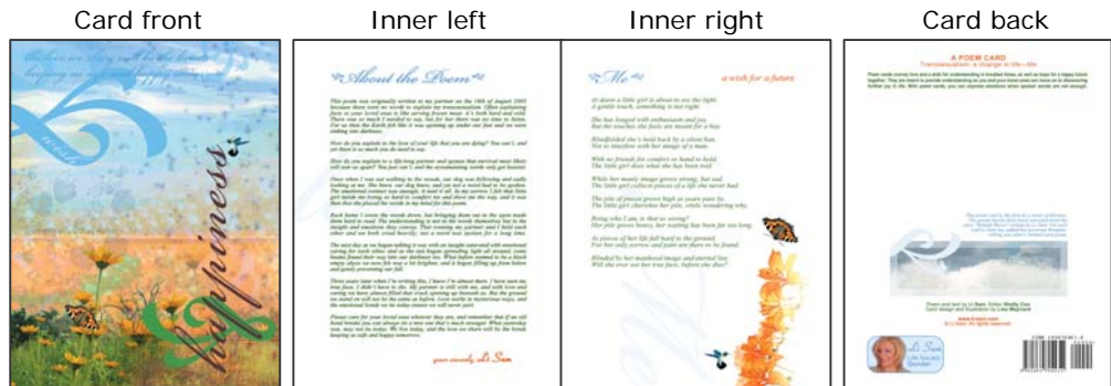
Inner layout varies depending on content