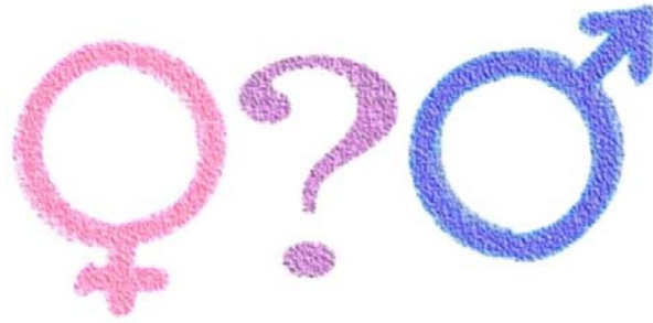
A question of identity

But what about our souls, the very persons we really are? We can become happier by changing our looks for the better and thus enter a new role, but inside we are still the same persons as before. So what is happening then?